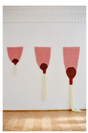
Madina Joldybek, Regular Star. Neutron Star. Black Hole, 2021, Acrylic, cotton, wool, 61 x 67 cm, 60 x 97 cm, 63 x 138 cm.