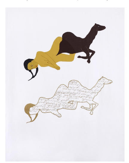
Kubra KHADEMI , The birth giving #04 , 2021, Technique mixte - applied fabrics and screen printing 200 x 150 cm, Unique piece