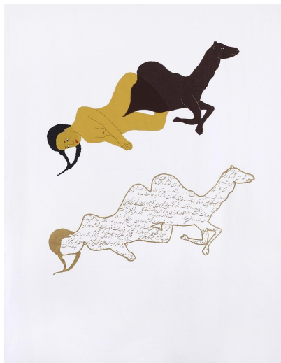
Kubra KHADEMI , The birth giving #04 , 2021, Technique mixte - applied fabrics and screen printing 200 x 150 cm, Unique piece