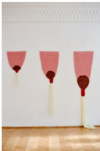
Madina Joldybek , Regular Star. Neutron Star. Black Hole , 2021, Acrylic, cotton, wool, 61 x 67 cm, 60 x 97 cm, 63 x 138 cm,