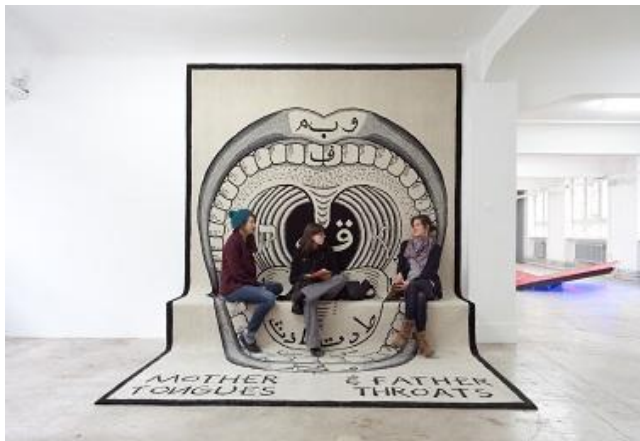
Slavs and Tatars , Mother Tongues and Father Throats , 2012, woolen yarn, ca. 500 × 300 cm. Installation view at Künstlerhaus, Stuttgart.

Guest Curator, the artists' collective Slavs and Tatars Central Asia and Textiles practices Diasporas A selection of galleries The new NOW ON section Special Projects